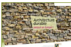
Poster for the sustainable architecture exhibition prepared for the ACE 20th anniversary.