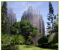
Jean-Marie Tjibaou Centre. Renzo Piano architect