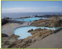
Leça swimming pool