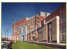
Lehigh Valley Hospital. Venturi, Scott Brown and Associates archi- tects