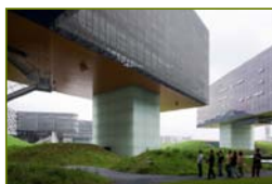
Horizontal skyscraper in Shenzhen. Steven Holl architect