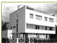
The Sonneveld House, photo: ©Jan Kamman. Collection: Nederlands fotomuseum Brinkman and Van der Vlugt architects