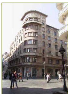
Facade of the French Cultural Centre in Belgrade (Serbia)