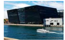
The Black Diamond in Copenhagen. Schmidt Hammer Lassen architect.

http://www.uia-architectes.org/en/exercer/nouvelles/8300#.UySCIV7cVmk