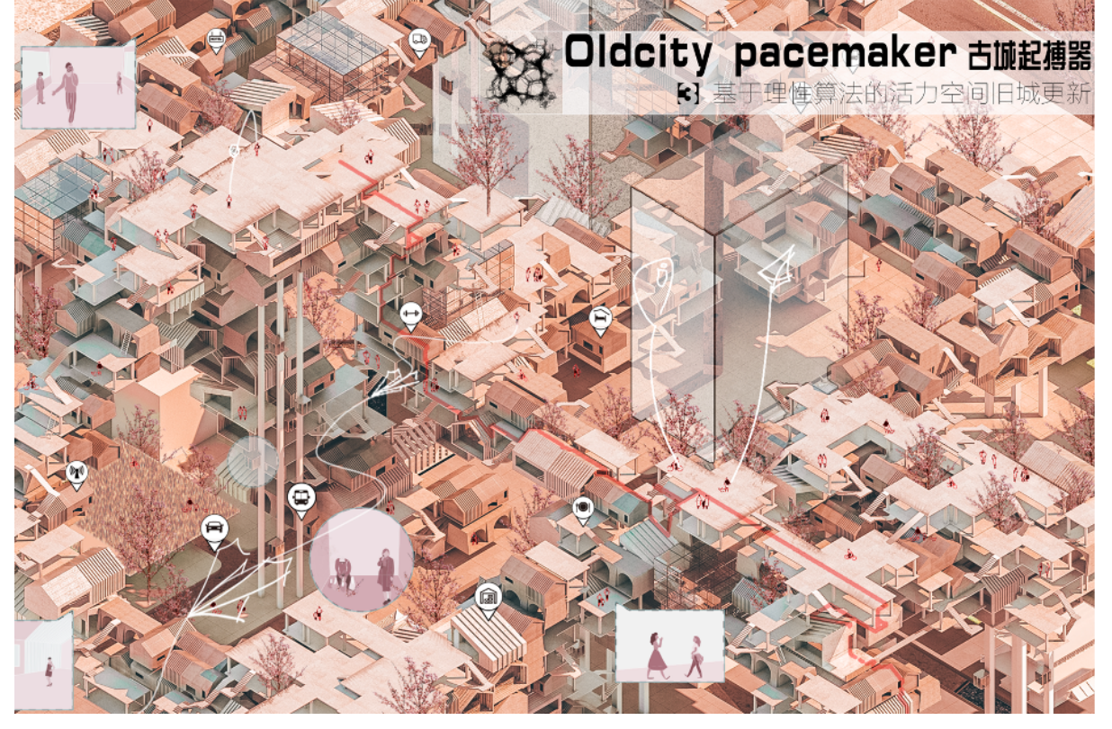
UIA-HYP Cup 2020 Winning Project: "OldCity Pacemaker"