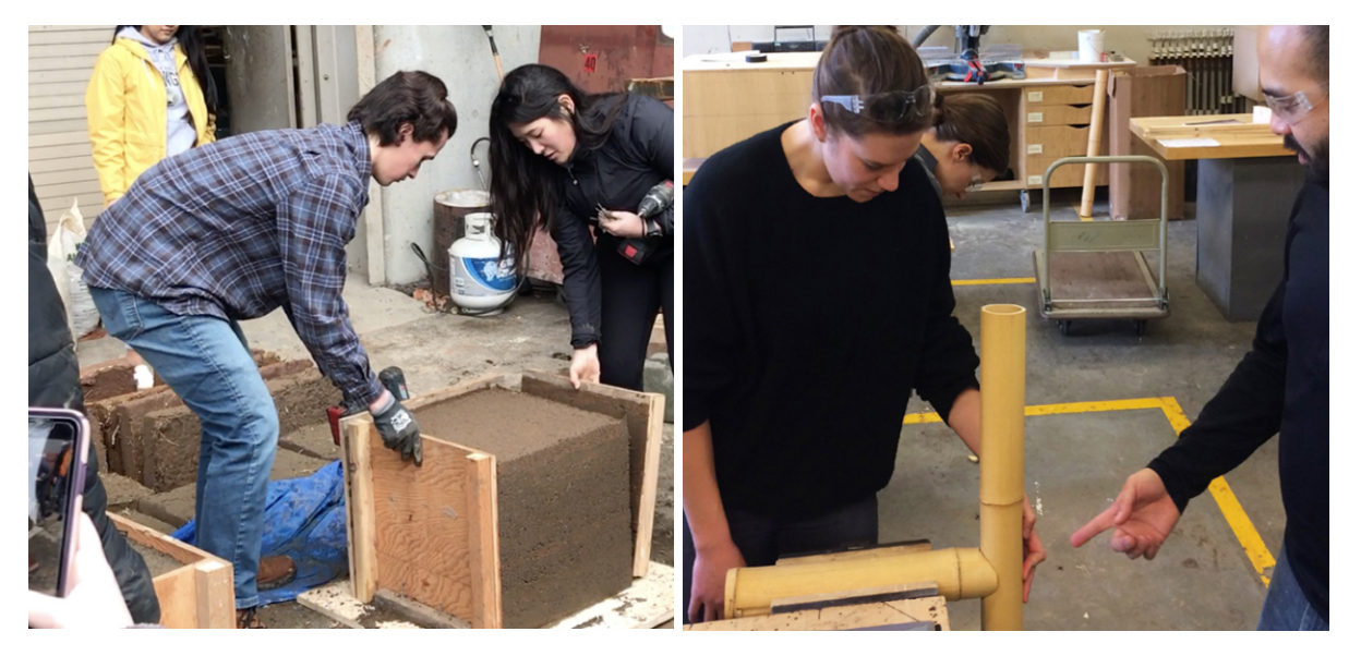
Student-led workshops: Rammed Earth (left) and Bamboo (right) from Traditional Building Methods, New Adaptations at University of Washington - Seattle

More information on the UIA Professional Practice Commission