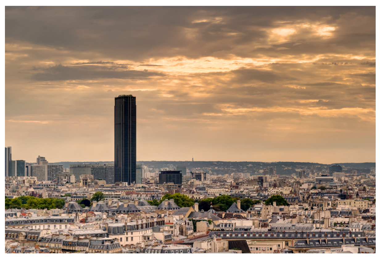
The Maine-Montparnasse Tour in Paris, France, Headquarters of the UIA Secretariat