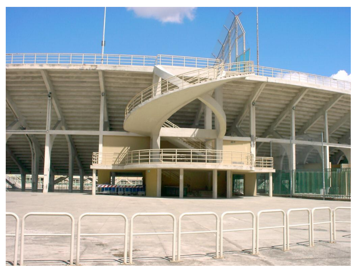
The Stadio Artemio Franchi in Florence, Italy