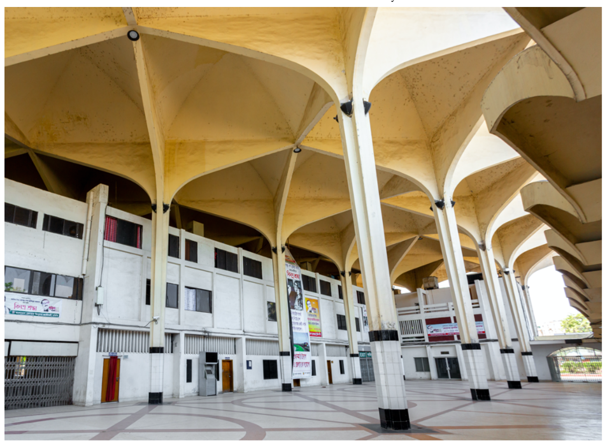
The Kamalapur Railway Station in Dhaka, Bangladesh