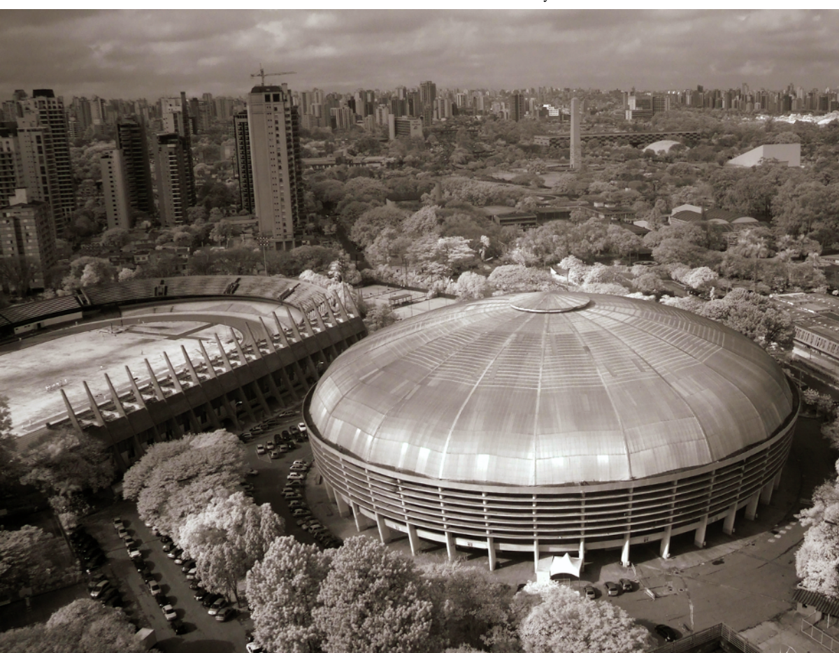
The Constâncio Vaz Guimarães Sports Complex, São Paulo, Brazil