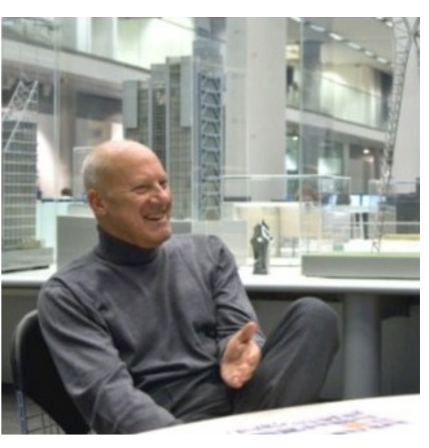
UNITED KINGDOM: RIBA NORMAN FOSTER TRAVELLING SCHOLARSHIP

The deadline for applications for the RIBA Norman Foster Travelling Scholarship is 24 April 2020. The scholarship offers £7,000 to a student of architecture demonstrating the "potential for outstanding achievement and original thinking on issues that relate to the sustainable survival of cities and towns." Invited schools may nominate only one student.