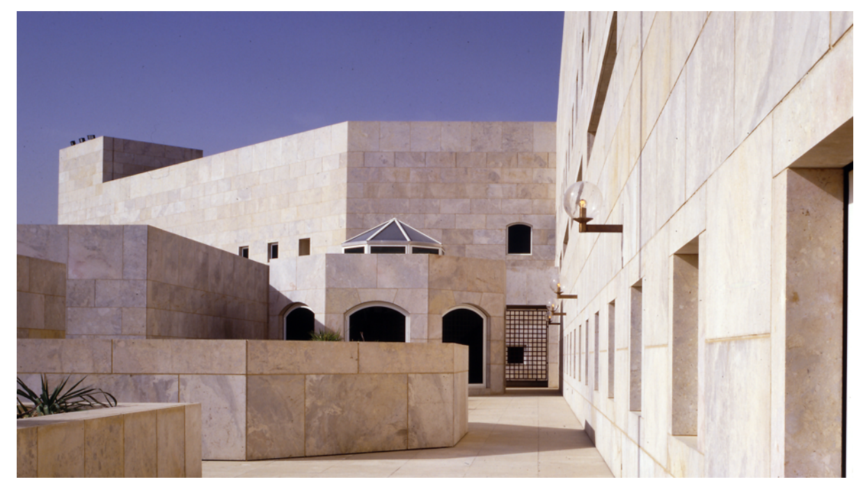
Ministry of Foreign Affairs, Riyadh, Saudi Arabia, architect Henning Larson (1984)